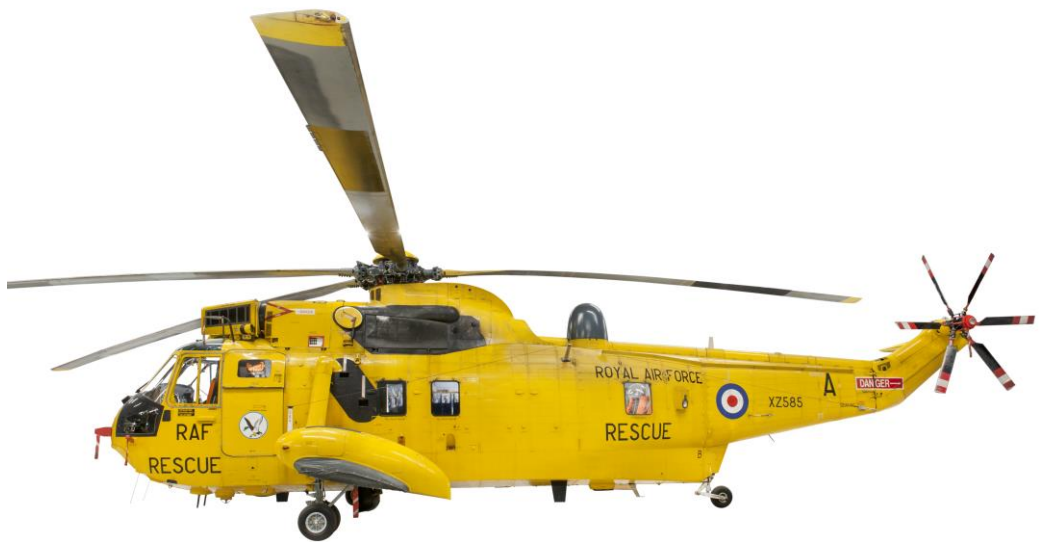
Sea King Search and Rescue Helicopter